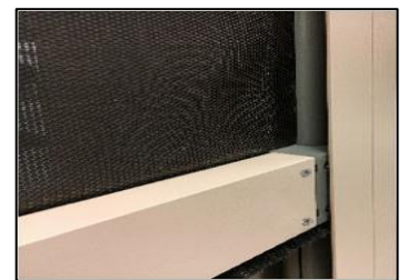
Integrated Weight Bar & Track