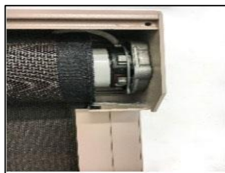
Larger Heavy Walled Rollers