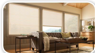
SHANGRI-LA® SHEER SHADINGS