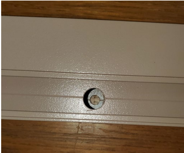
Sidetrack front hole