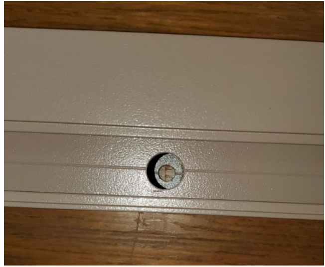
Sidetrack back hole