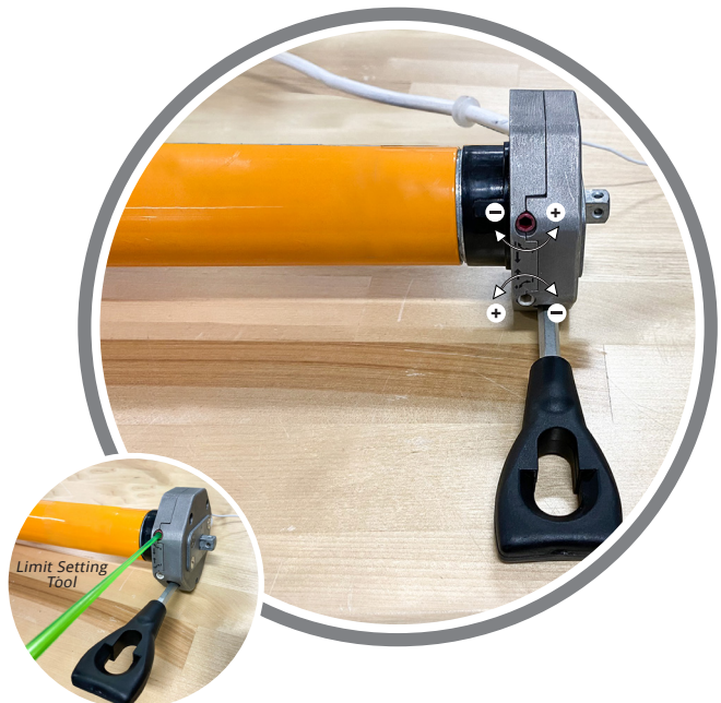
Use the limit setting tool for adjustments

On RH motor, the WHITE dial sets the "RETRACTED" limit, while the RED dial adjusts the "EXTENDED" limit.